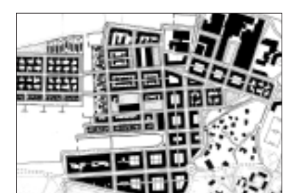
Left: Figure-ground diagram of the FMV Shipyards in Fredrikstad, Norway; existing conditions of the project area rendered by participants in the INTBAU Scandanavian Summer

Right: Proposed figure-ground of the FMV Shipyards project. The loose grid layout is derived from the existing buildings and the tracks of the historic dockyard cranes, which will be retained. The proposal envisages a very slow build-out, using the readily available good quality traditional Norwegian houses and some modern timber apartment buildings.