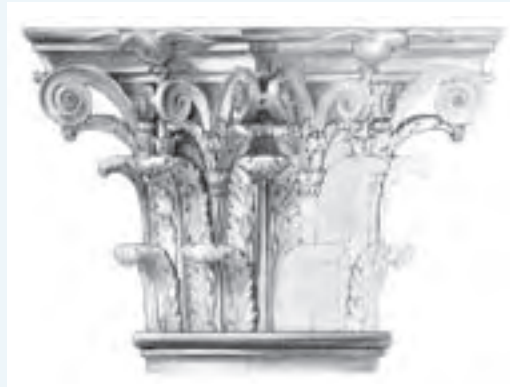
DESIGN DRAWING OF THE MONUMENTAL PLASTER ORNAMENTATION FOR THOMAS AQUINAS COLLEGE'S OUR LADY OF THE MOST HOLY TRINITY CHAPEL.