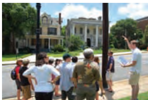
YOUNG ICA&CA VISIT TO MACON, GA.

The Southeast Young ICA&CA is in its second successful year of existence. The group recently elected a new board after several members moved on to graduate programs and other opportunities. The Young ICA&CA has strong representation from Atlanta area firms including Harrison Design Associates, William B. Litchfield Residential Designs, Cooper Carry, and Historical Concepts. The group is continuing its mission of reaching out to students and young professionals to advance the appreciation and knowledge of classicism and the allied arts and is closely integrated with the structure and events of the Southeast ICA&CA. Recent events include a sketching day at the Cyclorama Building in