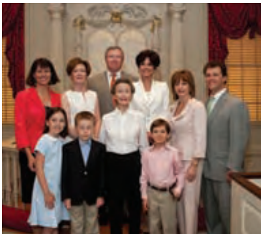
THE GODDARD FAMILY AT THE RENOVATED SHUTZE-DESIGNED GODDARD MEMORIAL CHAPEL AT THE RECENT REDEDICATION IN JUNE 2009.