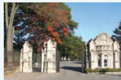
LOOKING EAST FROM JEROME AVENUE AT THE WESTERN GATE OF WOODLAWN CEMETERY, BRONX.