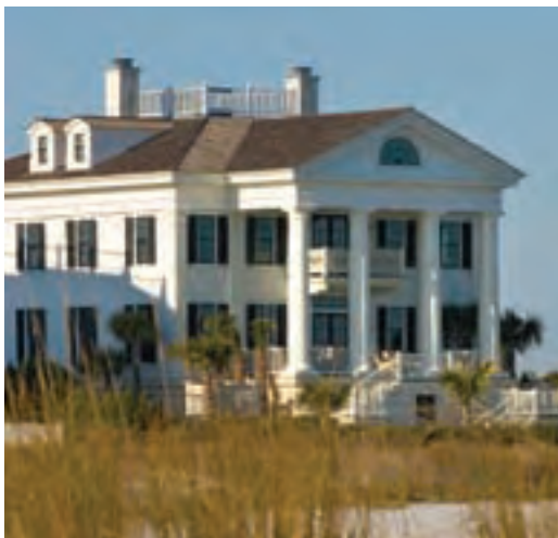
LEFT: THE 20-FOOT DORIC COLUMNS AND TEMPLE FRONT ON JEFFREY'S CHADSWORTH COTTAGE HOME MAKE IT A MEMORABLE LANDMARK FOR BOATS TRAVELING ALONG THE INTRACOASTAL WATERWAY. RIGHT: ONE OF JEFFREY'S FAVORITE FEATURES IN CHADSWORTH COTTAGE IS THE TOWER OF THE WINDS MANTEL — A CUSTOM DESIGN BY CHRISTINE G. H. FRANCK. Residential Design and Decoration by Christine G. H. Franck, Inc.

end, what made the most sense was a type of Palladian villa with a Roman temple front and high base. The high base was dictated by the local building code, which specifies that waterfront homes must have a raised first floor with breakaway construction below.