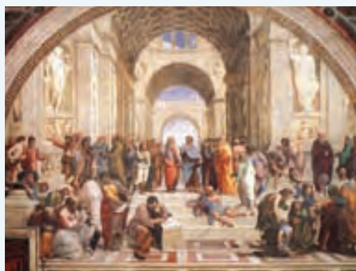
THE SCHOOL OF ATHENS BY RAPHAEL.

This course is an introduction to linear perspective, which is the intellectual basis for representational thought and spatial illusionism. The principal perspective system studied is based on Leonardo's model as well as that of 18th-century Englishman, Brook Taylor, and of 19th-century