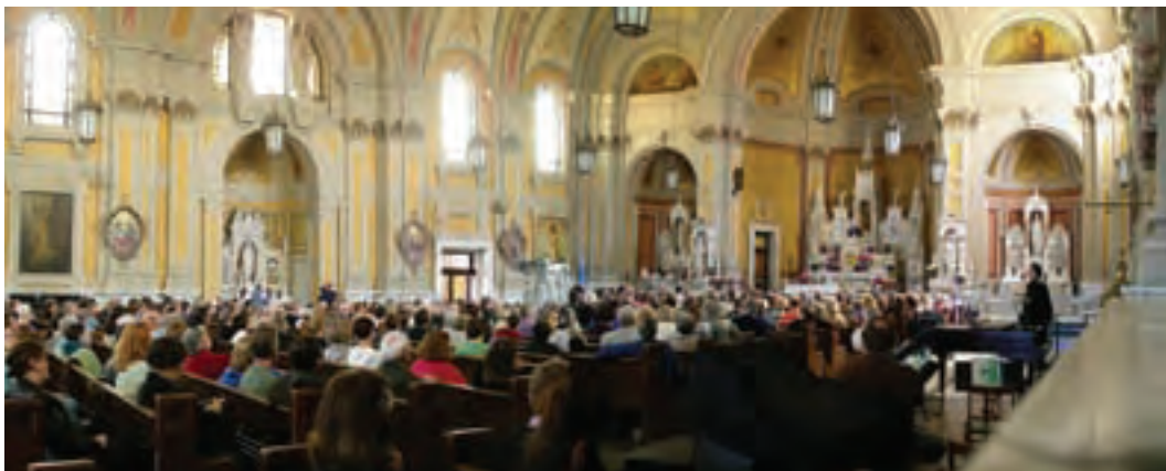
OHIO AND ERIE TOUR OF ST. COLMAN.

conducted. The following week, a tour is planned of the Mahoning County Courthouse in Youngstown, where a series of Blashfield murals is located. These events kick-off a series of tours of Beaux Arts-style civic buildings (built as a part of Cleveland's Group Plan of 1903) in conjunction with the extensive reconstruction of the Mall and underground Cleveland Convention Center soon to be under way.