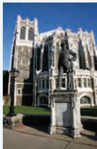
SHEPARD HALL, CITY COLLEGE OF NEW YORK, CONVENT AVENUE, NEW YORK CITY, NEW YORK.