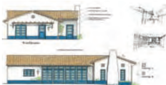
WINNING ELEVATIONS IN SOCAL'S HABITAT FOR HUMANITY DESIGN COMPETITION.

As part of its 2009 theme, "Vernacular Architecture in Los Angeles," the Southern California Chapter collaborated with Habitat for Humanity for its inaugural Affordable Housing Design Competition. Twenty firms nationwide — architects, interior designers, landscape architects, and those in the construction industry — entered the competition. The brief called for the design of a single-family home that captured Southern California vernacular styles including