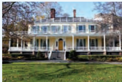
GRACIE MANSION, WATERFRONT FAÇADE.