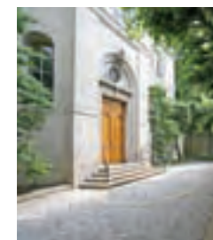
FROM LEFT TO RIGHT: ALTES MUSEUM BERLIN BY K. F. SCHINKEL; ARIEL VIEW OF PLAZA DE MAYO, BUENOS AIRES; THORVALDSEN MUSEUM IN COPENHAGEN; LAUGHLIN HOUSE, WASHINGTON, D.C.