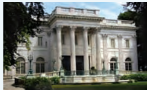
MARBLE HOUSE, NEWPORT, RHODE ISLAND