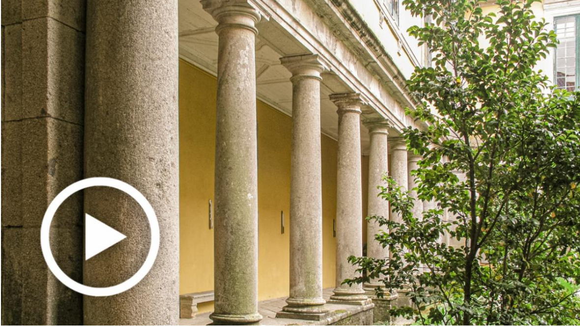
Image: The Convent of Refóios do Lima | CC BY-SA 3.0