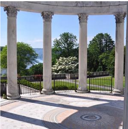
EPISODE 8 Untermeyer Gardens with Steve Byrns