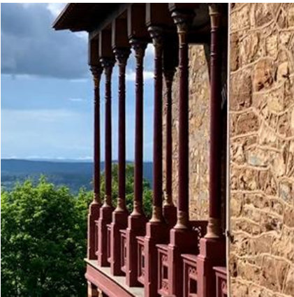
EPISODE 5 Hudson, NY with Elizabeth Graziolo