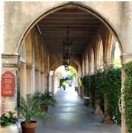
EPISODE 6 Via Mizner with Anne Fairfax