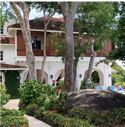
EPISODE 10 Two Homes in Acapulco, Mexico with Sophia Loyzaga of Loyzaga Design