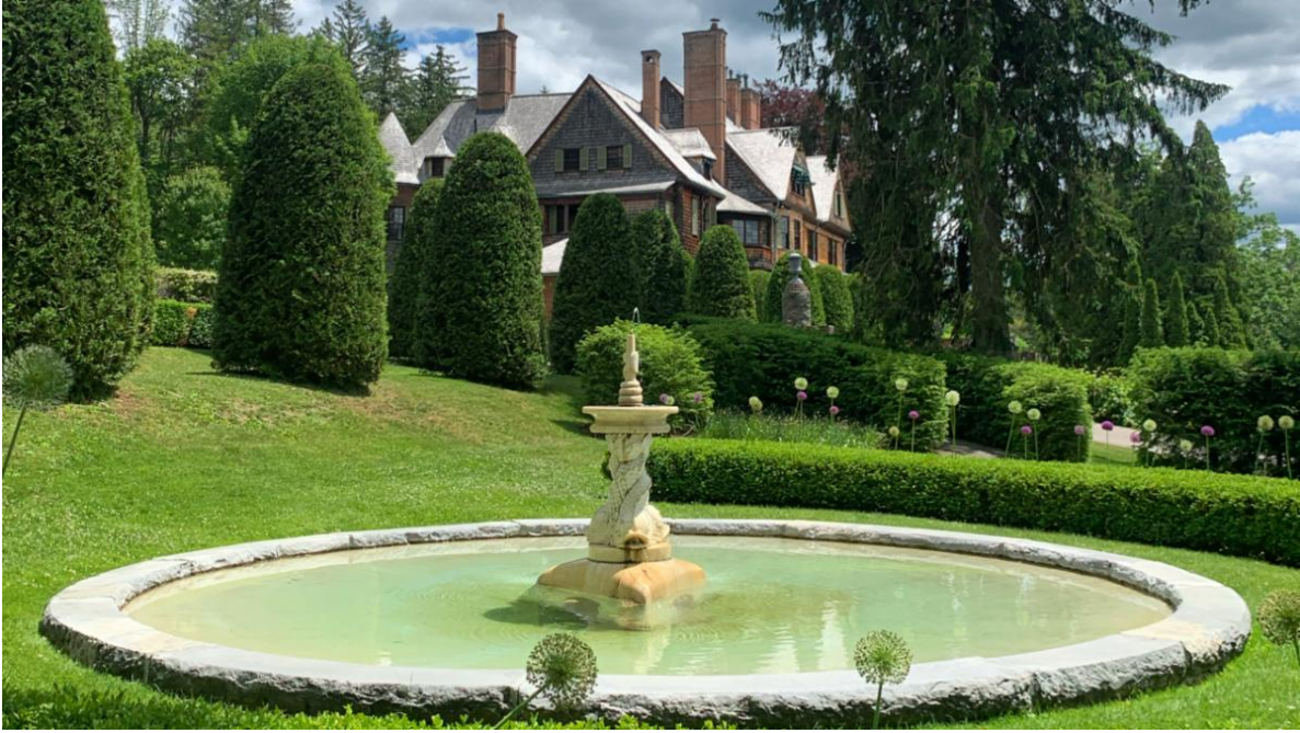
Pictured: Naumkeag, designed by McKim, Mead & White and located in the Berkshires

The ICAA is pleased to announce the resumption of in-person travel programs in 2021, once again opening access to a world of design and architectural discovery and inspiration, and offering the opportunity to share unforgettable experiences with fellow classicists.