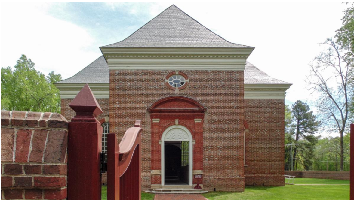
Image: Front of Historic Christ Church (1735) in Lancaster County, VA

Lead Sponsor for Continuing Education courses: Uberto Construction .