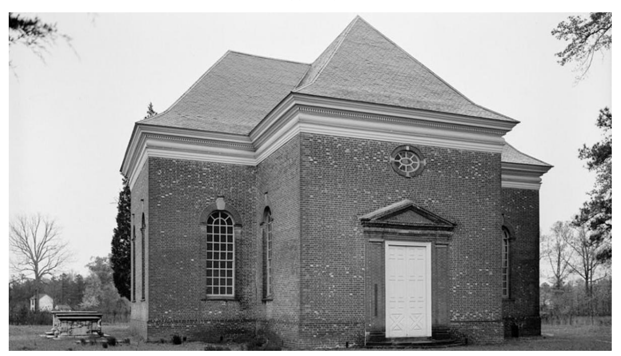
Pictured: Front of Historic Christ Church (1735) in Lancaster County, VA