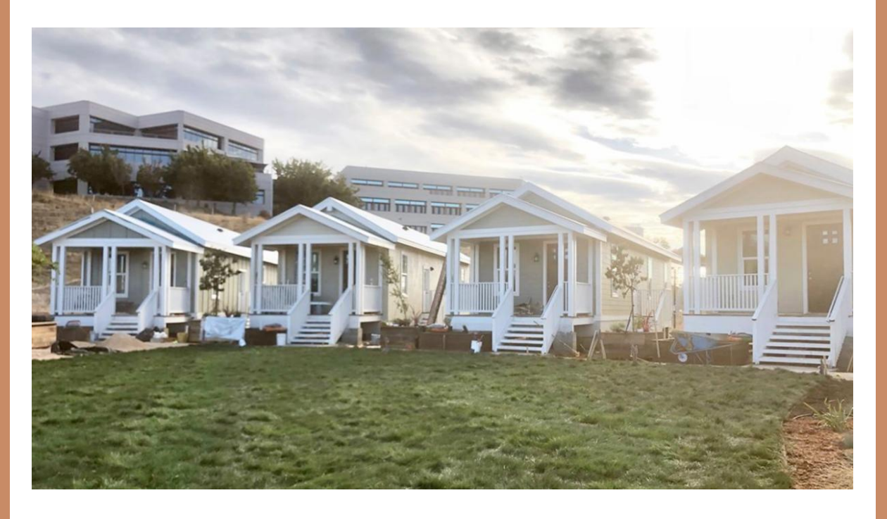
Monday, November 16 1:00 PM EST

Housing policy and the design of our cities intersect all aspects of our lives from the fabric of our society to the strength of our economy. When segmented groups are excluded from participating in the full economy all of society loses. Ironically, the