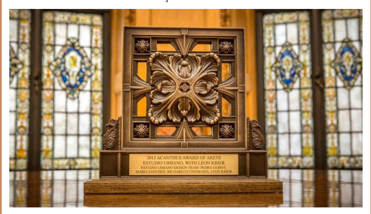
Thursday, November 19 5:45 PM CST / 6:45 PM EST

The Chicago-Midwest Chapter of the Institute of Classical Architecture & Art is pleased to announce the 2020 Acanthus Awards. These awards recognize and promote excellence in classical and vernacular design. This year's celebration will be a virtual awards ceremony, so no matter where you are located, be sure to mark your calendars for an evening of celebration!