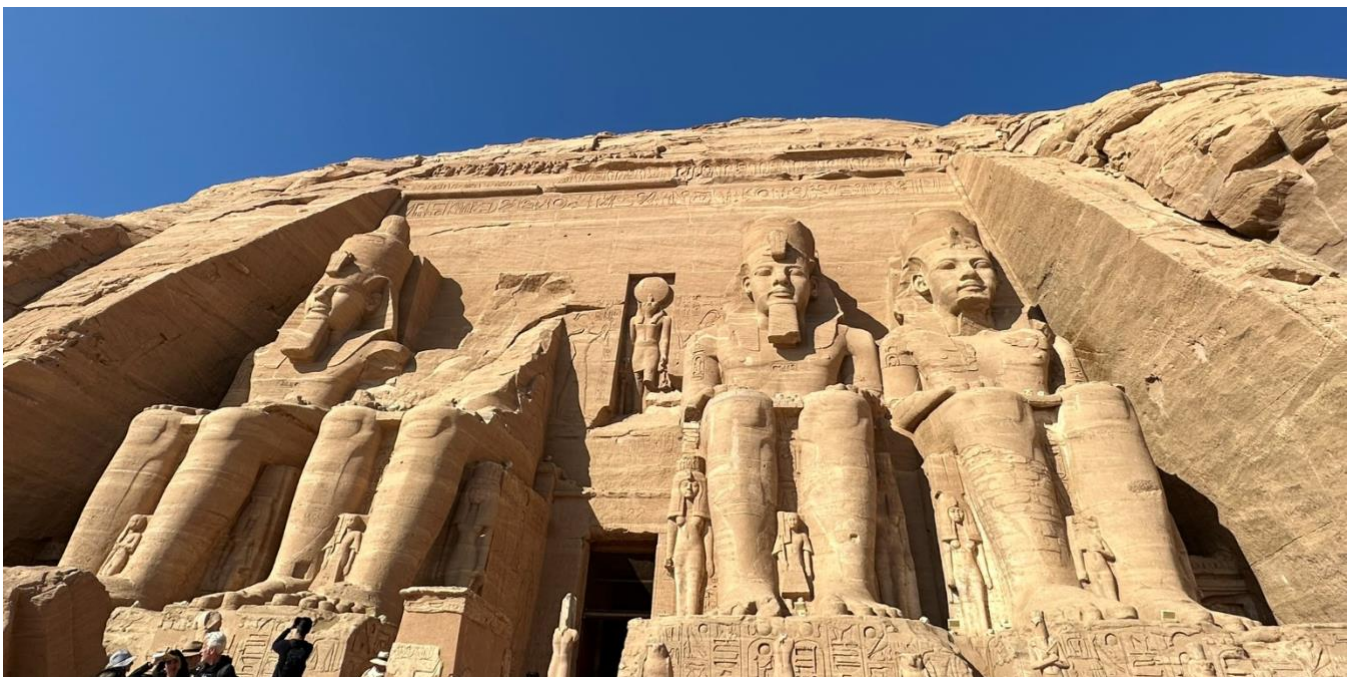
The Great Temple of Abu Simbel, January 2024. The single entrance is flanked by four colossal, (66 ft) statues, each representing Ramesses II seated on a throne and wearing the double crown of Upper and Lower Egypt.

Tour arrangements by Classical Excursions