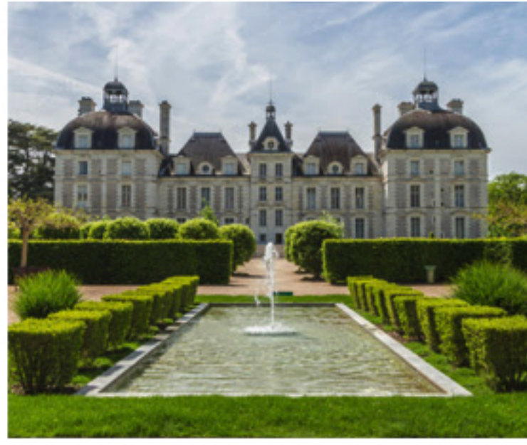
Château de Cheverny in the Loire Valley

SEPTEMBER 29 - OCTOBER 2 Chicago's North Shore (sold out)