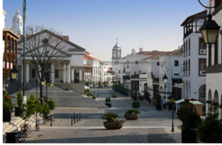
Paseo Cayalá at Ciudad Cayalá, Guatemala

The following winners of the 2016 Arthur Ross Awards will be honored at a ceremony on May 2nd at The University Club in New York: