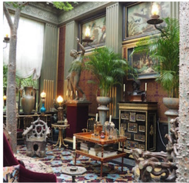
Château du Champ de Bataille

November 12-19 Private Houses & Gardens of South Africa